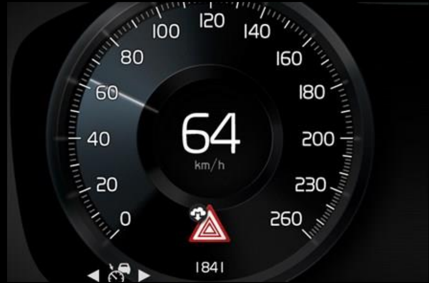
Hazard Light Alert