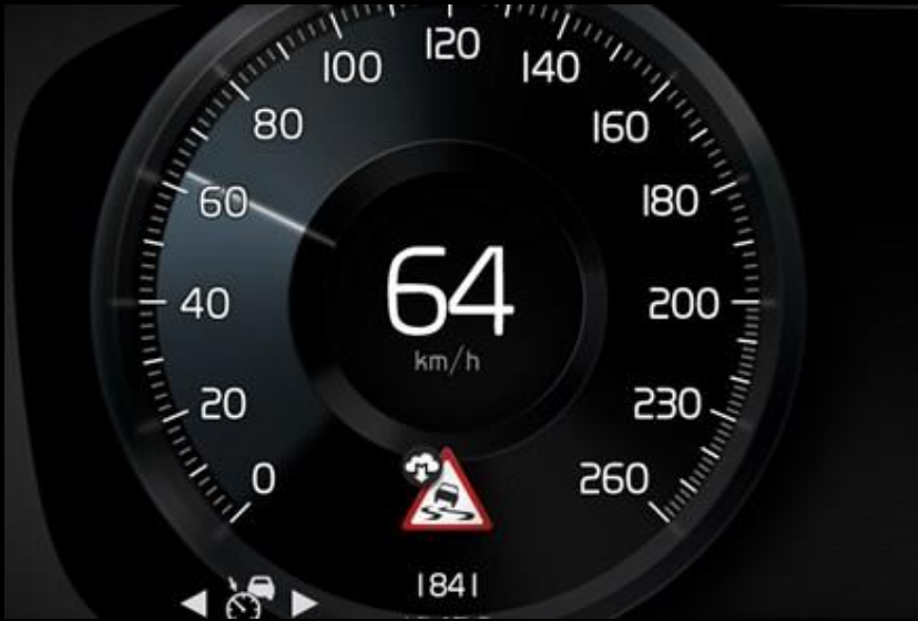
Slippery Road Alert